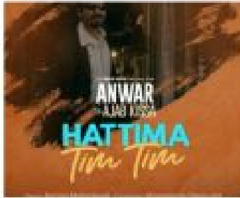
Anwar Ka Ajab Kissa (2020) Movie Mp3 Songs