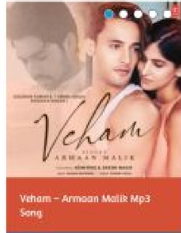
Veham – Armaan Malik Mp3 Song