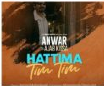
Anwar Ka Ajab Kissa (2020) Movie Mp3 Songs