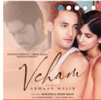
Voham – Armaan Malik Mp3 Song