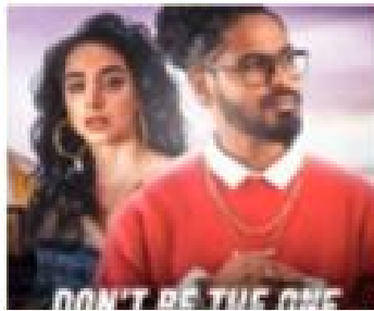
Don't Be the One – Emiway Bantoi Mp3 Song